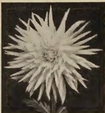
SARETT'S PINK FLAMINGO